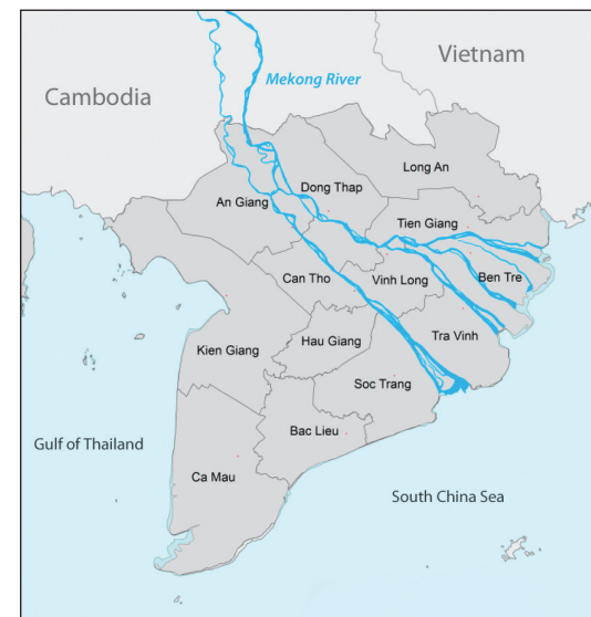
Map of the Delta Region Provinces, Vietnam

Kampuchea-Krom literally means „the lower land of Kampuchea“ and Krom implies „below“ to indicate the „Southern“ part of Cambodia. Kampuchea-Krom was the southernmost territory of the Khmer Empire, and was once known as Cochin China (French). It covers an area of 67,700 km 2 with Cambodia to the North, the Gulf of Thailand to the West, the South China Sea to the South and the territory of the Champa to the Northeast. Today, Kampuchea-Krom belongs to the south-western part of Vietnam. It originally consisted of four provinces and was later divided into 21 provinces and 1 port. 39