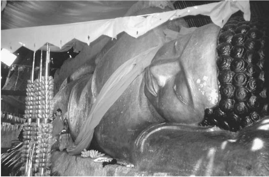
Preah Ang Thom—Phnom Kulen, Svay Leu District, Siem Reap Province.