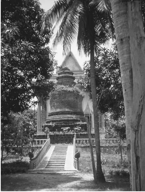
Great stūpa —Wat Sithor, Srei Santhor District, Kompong Cham Province.

Prampil Lvaeng and Tang Tok, both at Angkor Thom, and Preah Theat within the precincts of Wat Unnalom in Phnom Penh.