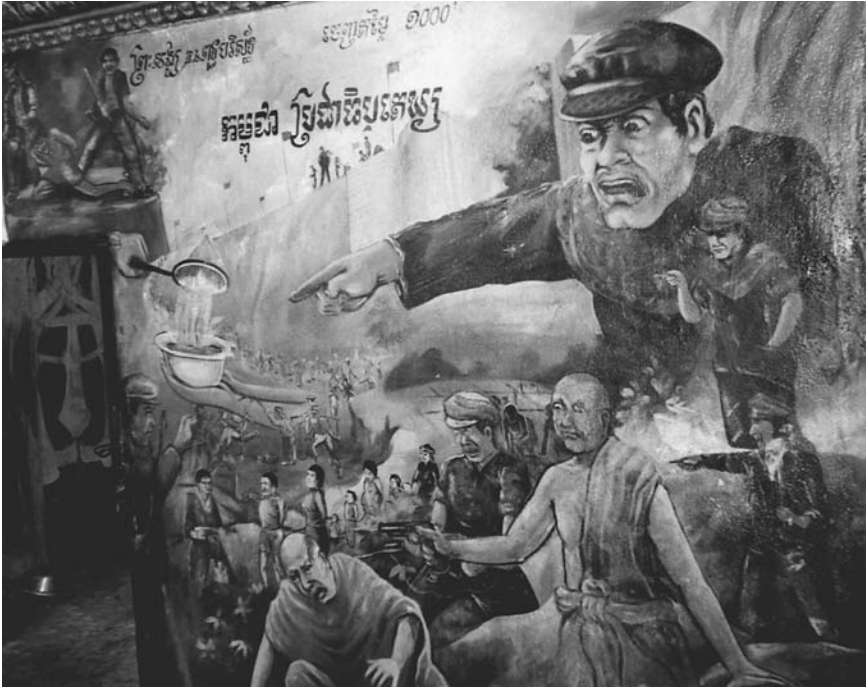
Mural of Khmer Rouge hell—Wat Kompong Thom, Kompong Thom Province.

seems that the practice of the unified order was oriented around Mahanikay interpretations of monastic discipline ( vinaya ). 16