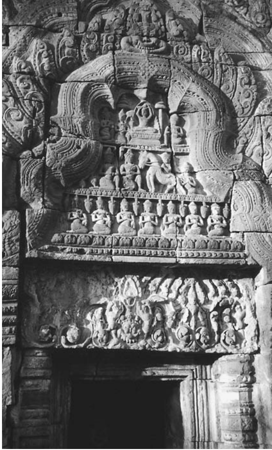
The future Buddha, cutting off his topknot—southern pediment of central prasad ; Wat Nokor, Kompong Siem District, Kompong Cham Province.

was the focus of significant attention (Thompson 1999, 164n63). With these facts in mind, Ashley Thompson has suggested that some post-Angkorian stūpas of the sort mentioned above were connected with the Maitreya cult. At Wat Nokor, four Buddha figures were arranged so that they faced out from the four antechambers of the cruciform structure. Similar configurations may be found in adjacent chapels (Thompson 2000, 246–247). The pattern also occurs at Angkor Wat, where the four doorways of the central tower were closed with sandstone blocks carved with images of standing buddhas at around the same time. Contemporary residents regard these images as representations of the