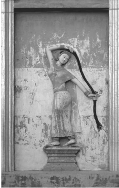
The earth goddess, Nang Thorani—Wat Buddhaghosa, Phnom Penh.