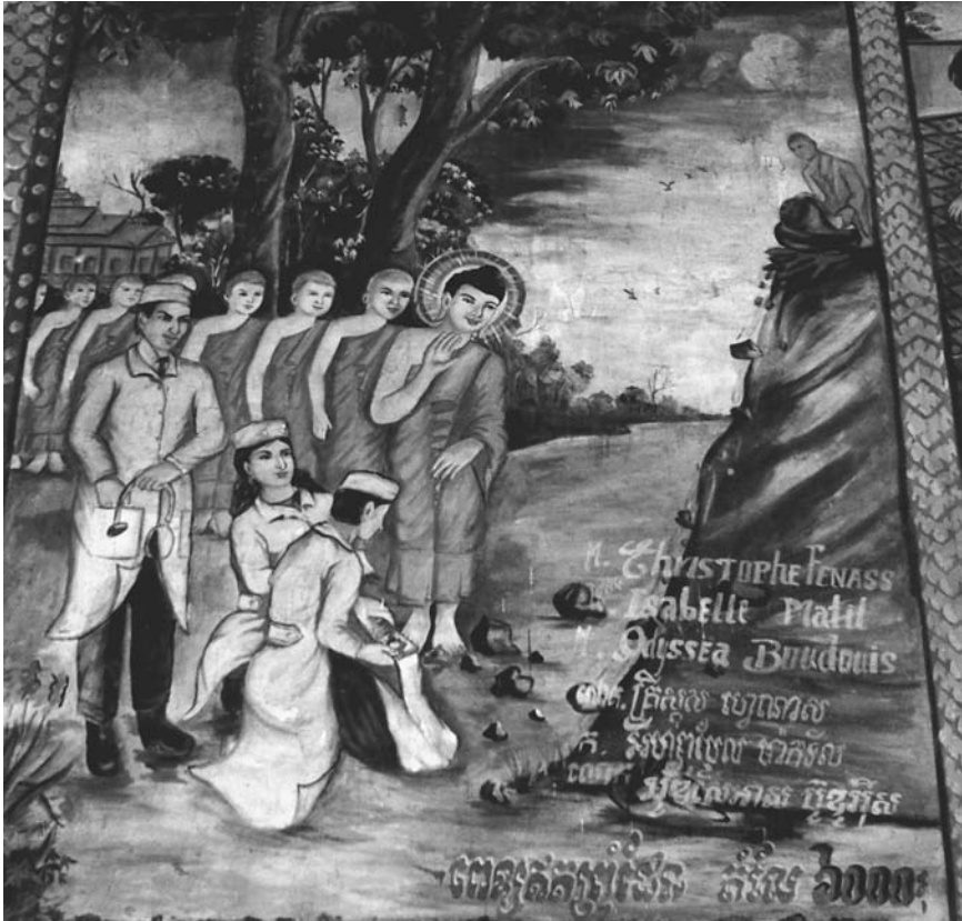
Traditional mural of the Buddha after being attacked by Devadatta. Less traditionally, he is tended by named Western patrons—Wat Kompong Thom, Kompong Thom Province.