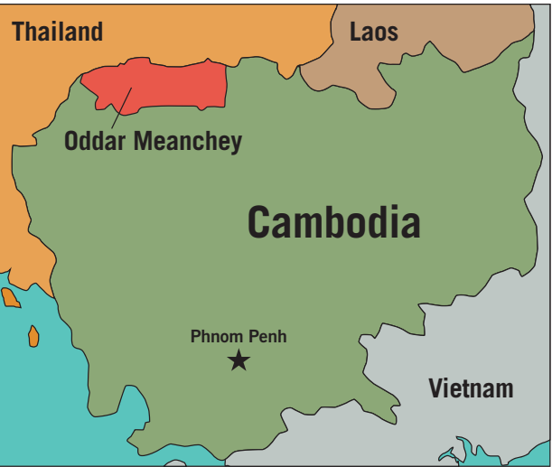
FIGURE 2: LOCATION OF ODDAR MEANCHEY PROVINCE, CAMBODIA

Dialogue participants toured three of the 13 community forestry groups participating in the OM-REDD-plus project, accompanied by members of NGOs and communities associated with the project. Question-and-answer sessions were held to further tease out the experiences of community groups, including the challenges they face and the benefits they expect from REDD-plus. On day 1, participants visited the Sang Rukhawan community forest, which is managed by a group of Buddhist monks known as the Monks’ Community Forest Association. The monks are responsible for implementing the conservation objectives of six surrounding villages, with a combined jurisdiction of about 18,000 hectares of forest. On Day 2 participants visited the Samaky community forestry group and the Samaki Sangkros Prey Chheo community forestry group, which encompass 1,079 and 4,151 hectares of protected forest, respectively.