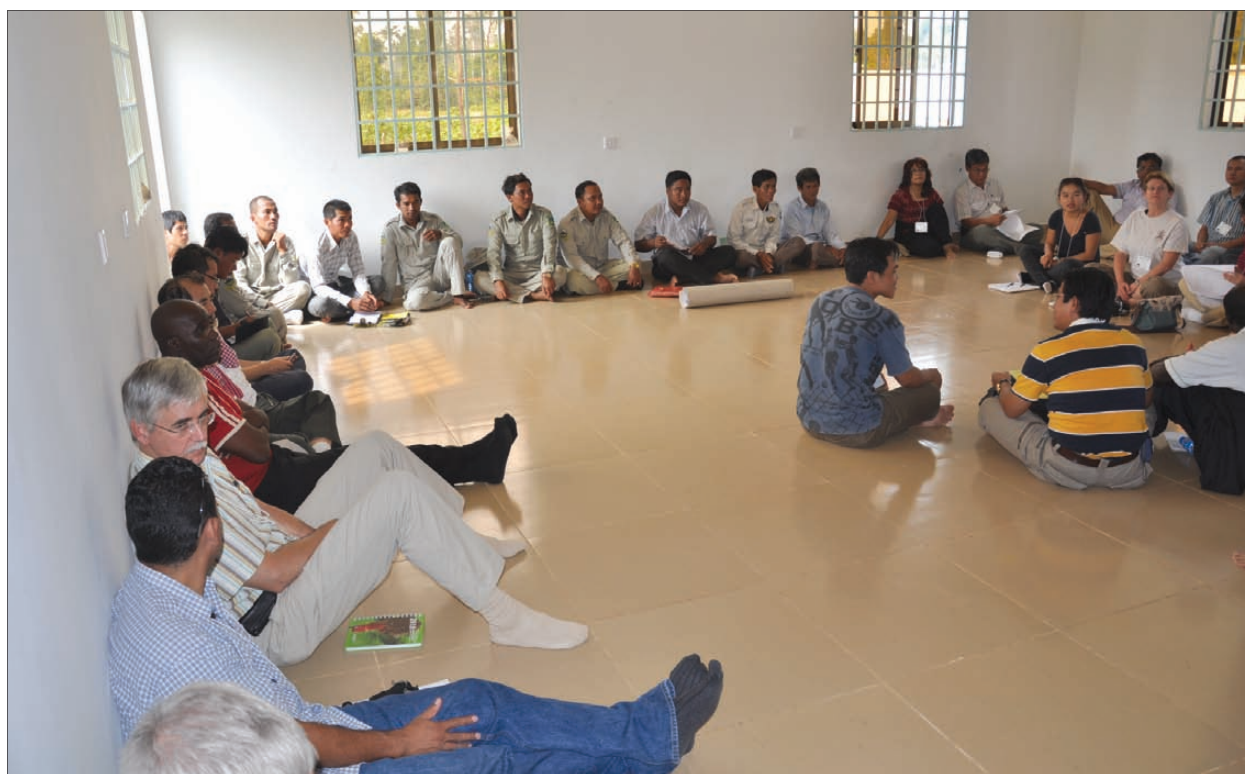
Meeting with local stakeholders at the Samaki Sangkros Prey Chheo community forestry group.

Many meetings were held between Pact, the Children's Development Association and community leaders during the readiness phase of the OM REDD-plus demonstration project. Much of the purpose of those meetings, however, appeared to be the dissemination of