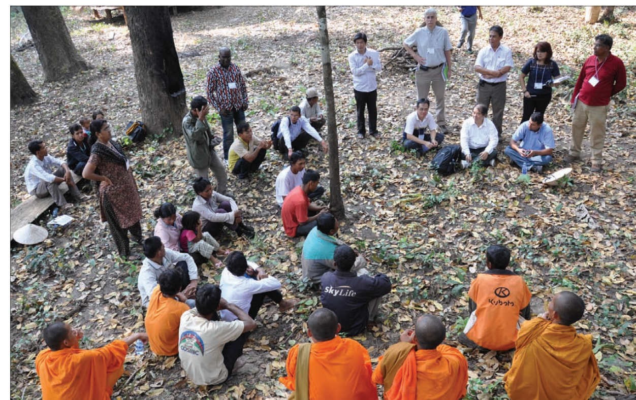
Participants visit Sang Rukhawan community forest

Northern plains: Following the experience of WCS in the Seima Protection Forest, a similar feasibility assessment was undertaken in the northern plains of Preah Vihear Province and was due to be completed in 2010. Preliminary results are promising, and it is likely that at least some management units will be able to proceed to the development of a project design document in 2011 (WCS-Cambodia 2010).