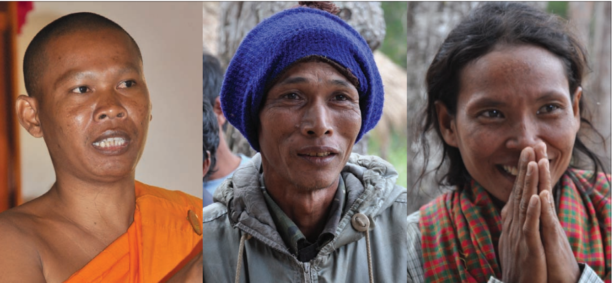
Community forestry stakeholders in Cambodia.