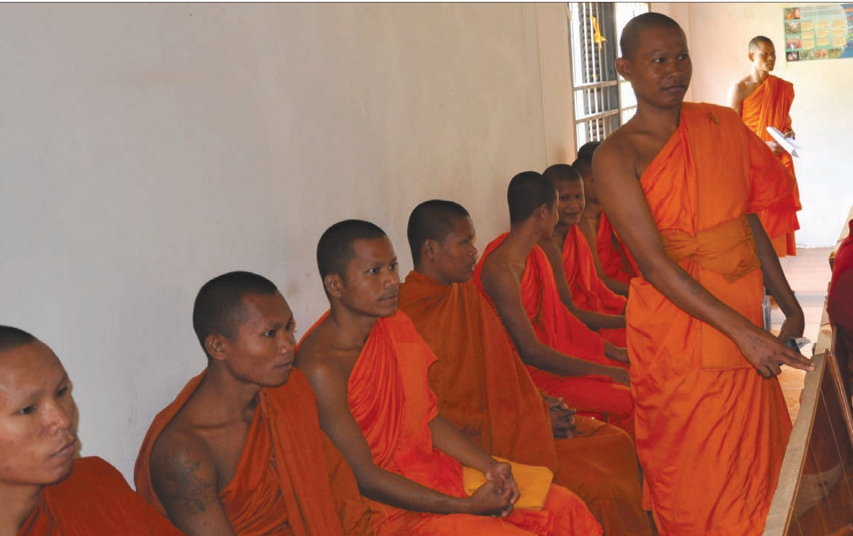
Meeting with the Monks’ Community Forest Association at the Sang Rukhawan community forest