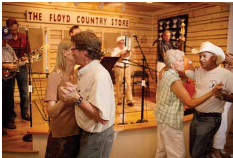
Dancing on the old wood floors at the Floyd Country Store is one of the many unique local experiences tourists love about the Crooked Road.

Protect community gateways: control outdoor signage. First impressions matter. Some Virginia communities pay attention to their gateways. Other do not. Many communities have gotten used to ugliness, accepting it as inevitable to progress.