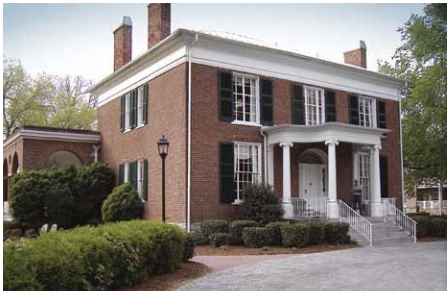
Yes, it's is Hampton Inn. The owners of the Lexington Hampton Inn converted the 1827 Col Alto Mansion into the centerpiece of a 76-room hotel near historic downtown Lexington. It's a chain hotel that fits in with its historic community.

mer put it this way: "Among cities with no particular recreational appeal, those that have preserved their past continue to enjoy tourism. Those that haven't receive almost no tourism at all. Tourism simply won't go to a city or town that has lost its soul."