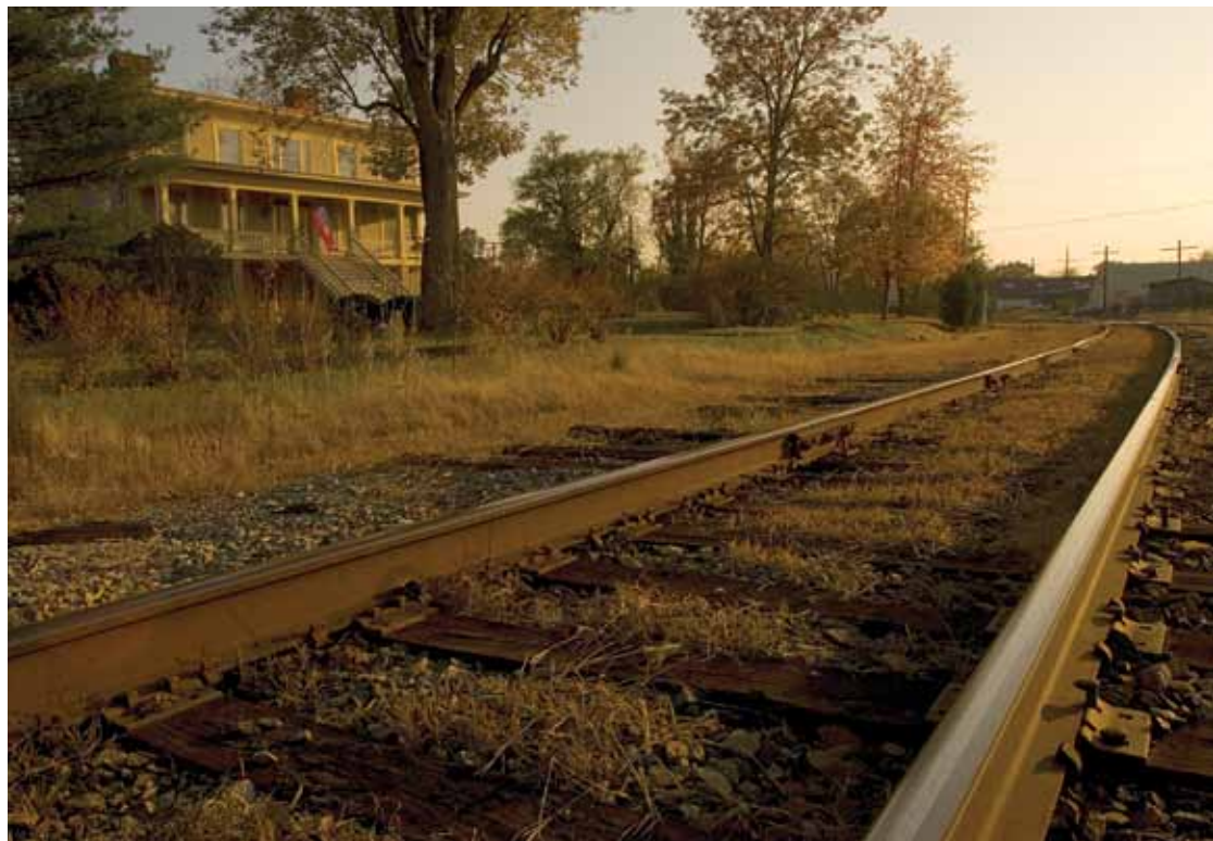
The Civil War Museum in Gordonsville is one of many Civil War attractions within the Journey Through Hallowed Ground National Heritage Area. The Hallowed Ground partnership promotes nine presidential homes, more than 30 historic Main Street communities and numerous other historic and natural attractions.

The more a community does to enhance its uniqueness, the more people will want to visit.