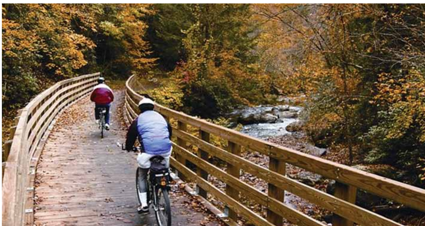
The Virginia Creeper Trail stretches 34 miles from Abingdon to Damascus, Va., along the Whitetop Laurel River. The Virginia Creeper Trail is open year round to hiking, mountain biking and horseback riding.