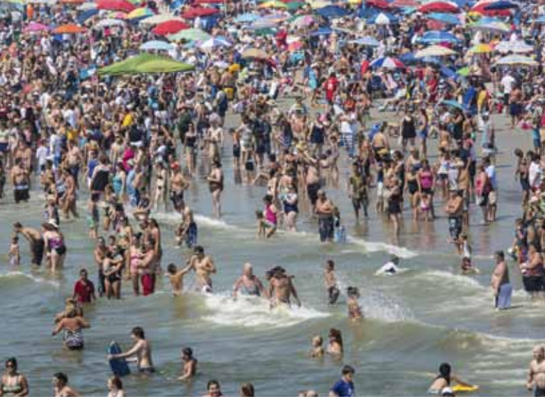
Decades ago, Fort Lauderdale was the Spring Break Capital of America. Since then, the city has changed its tourism strategy and today enjoys lower volume, lower impact tourism with higher yield.

To understand mass market tourism, think about mega hotels, theme parks, chain stores and the new generation of enormous (4,000 to 5,000 passenger) cruise ships. Mass market tourism is about quantity. Mass market tourism is also about environments that are artificial, homogenized, generic and formulaic. In contrast, responsible tourism is about quality. Its focus is places that are authentic, specialized, unique and homegrown. To understand responsible tourism, think about unspoiled scenery, locally-owned businesses, historic small towns and walkable urban neighborhoods.